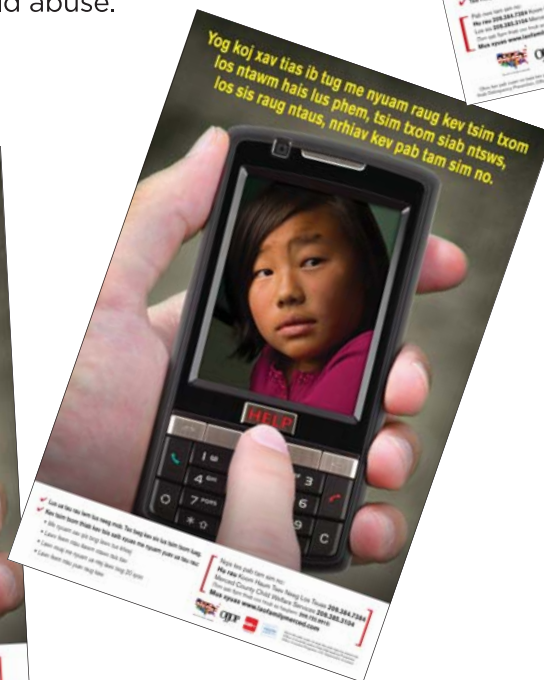
Posters (English/White Hmong)