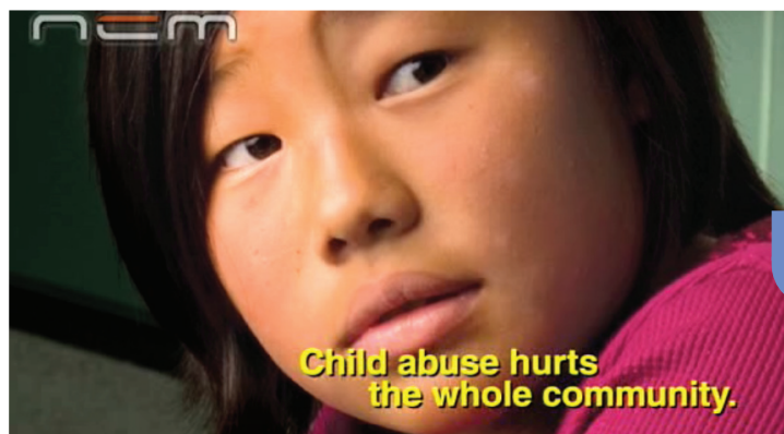
15 second Movie Theater Ad (English)