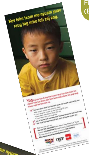
Flyers (English/White Hmong)

The Hmong Community is deeply rooted in cultural traditions. As a linguistically isolated community with high rates of illiteracy, the Hmong encounter challenges in transitioning and adapting to life in the United States. Cultural differences in approaching child rearing, discipline and treatment of illnesses are risk factors that can lead to child abuse.